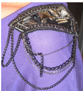
one of our new stock items

Glitz is glitzier than ever. It comes in the form of shiny zippers, zipper tape embroideries or diamante and stud motifs and epaulets, ( French for on the shoulder ), are the latest craze and we have a wide selection in different sizes with dangling chains, studs and sequins.